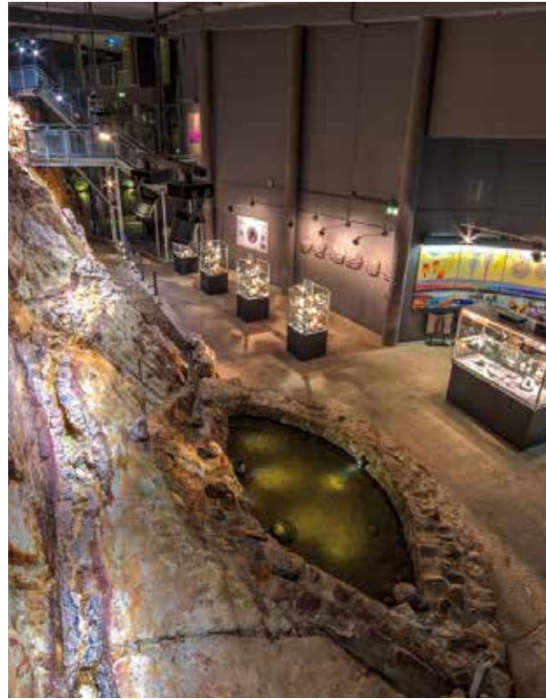
LARGEST EXPOSED AMETHYST BELT!

Duration: approx. 1 hour, access only with guided tour.