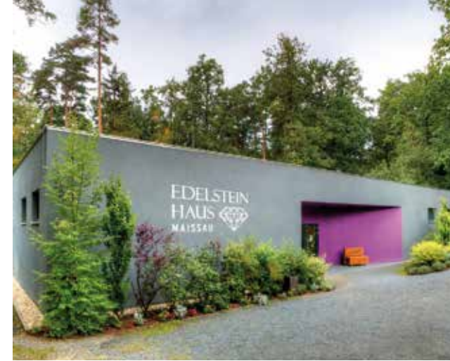
FASCINATING GEMSTONES FROM ALL OVER THE WORLD!

Duration: approx. 1 hour, access only with guided tour.